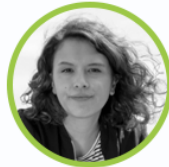
Delara Burkhardt, Member of the European Parliament